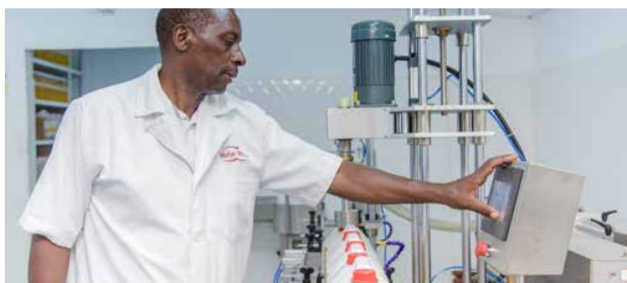
Jackma sunflower oil processing facility in Dodoma.