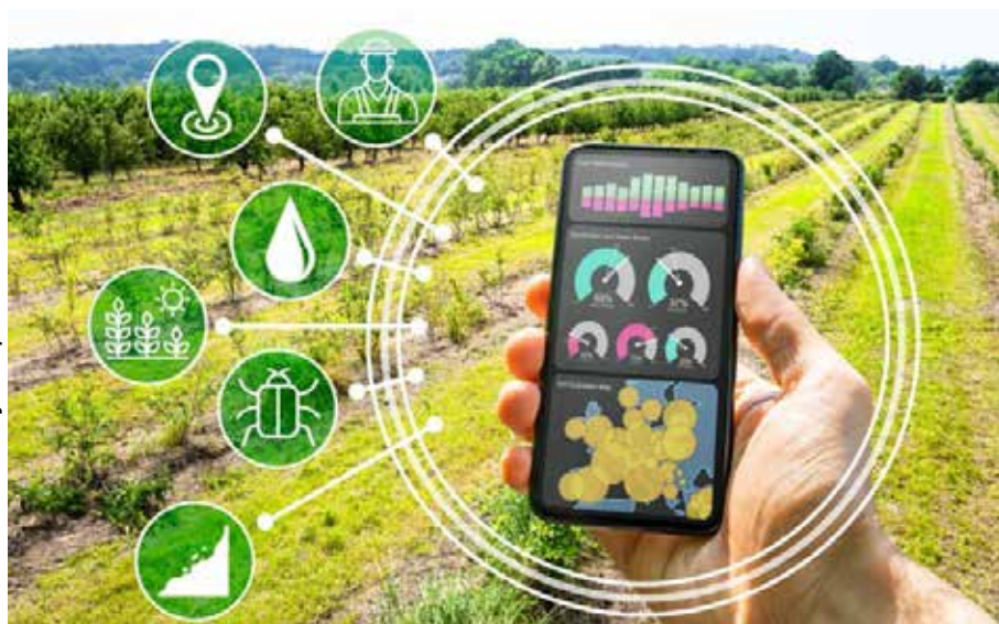
Application of drone in agriculture