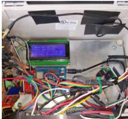
Figure 2: Wireless precision irrigation controller developed by University of Florida and SUA.

(Example Figure 2) to accomplish the work. Unfortunately, the cost of the platforms, sensors and controllers to read the data may cost thousands to millions of Tanzanian shillings.