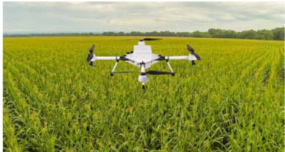
Application of drone in agriculture

SHPs can also adopt global positioning system (GPS) for