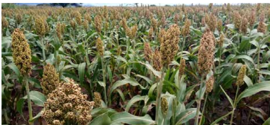
A sorghum demonstration farm in Ndurugumi village in Kongwa district, Dodoma, as facilitated by KFS.

quality declared seed (QDS) users. The project is expected to reduce post-harvest losses from the current 15% to about 5%. By increasing sorghum productivity and creating a reliable market, SHPs are expected to increase income from TZS 70,000 to TZS 350,000 per acre. The increase in productivity and improved quality of sorghum will meet the market demand where these companies need to supply about 30,000MT of sorghum to their customers.