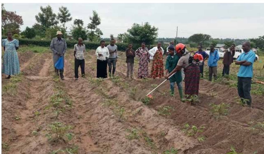
A farmer at a demonstration plot in Serengeti, Mara, applying good agronomic practice in consideration of proper spacing and ridging.

disease (CMD). One of the steps in fighting pests and diseases is a correct diagnosis. Therefore, IITA and the USA-based Pennsylvania State University collaborated to develop and launch a NURU (Swahili for light) App. This artificially intelligent assistant accurately recognizes leaves damaged by these two diseases as well as damages caused by red and green mites. The App is available in PlantVillage and at Google's Play Store and can communicate in Swahili and English languages.