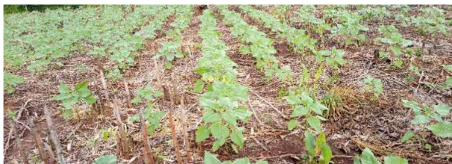
Sunflower demonstration farm managed by Temnar company, showcasing mulching for soil and water conservation.

CRAFT project has partnered with over 36 SMEs and producer cooperatives to facilitate market linkages for climate-smart agriculture (CSA) to enhance CSA through sustainable intensification along selected oil crops, pulses, cereals and potato value chains in Tanzania, Kenya and Uganda. The objective of the project, which is funded by the Ministry of Foreign Affairs of the Netherlands, is to strengthen food security through inclusive business. The project addresses agribusiness scaling through capacity building, policy alignment, policy reforms