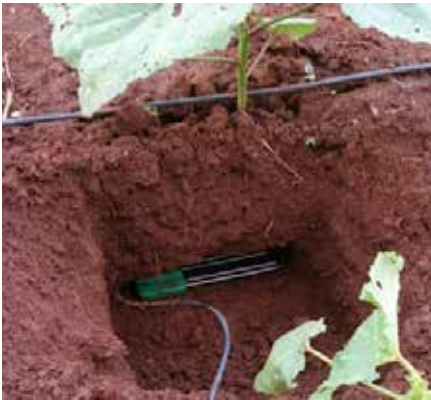
Figure 1: Soil moisture and temperature sensor installation at Sokoine University of Agriculture.